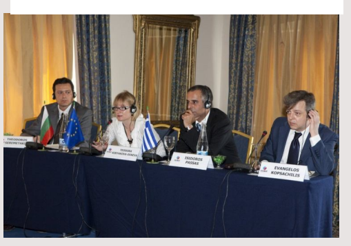
Panel of the 2nd session