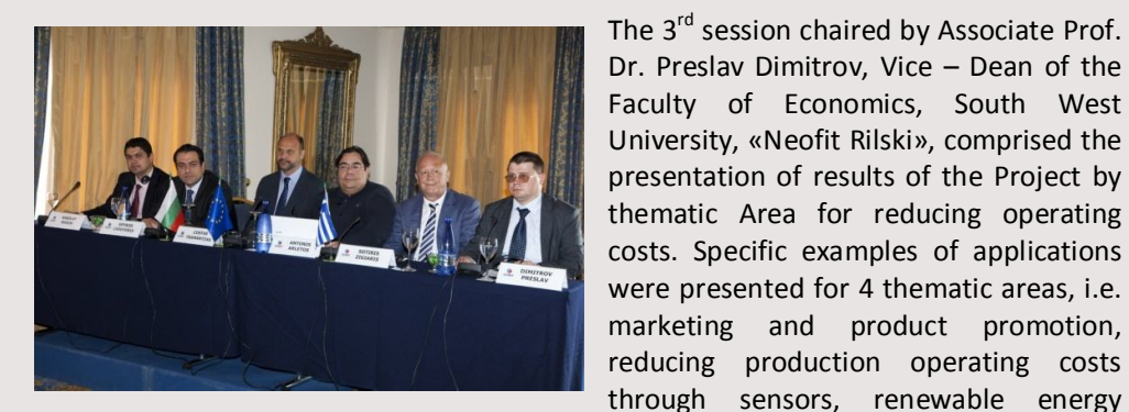
Panel of the 3rd session