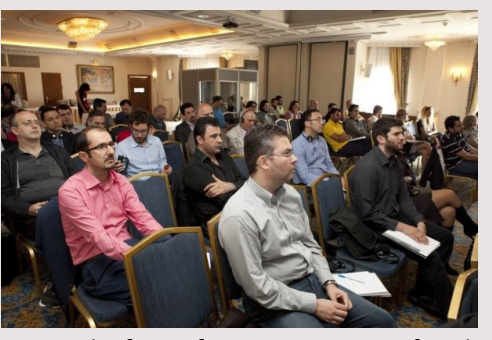
A view of the audience

innovative tools and the overall SMEs cost-